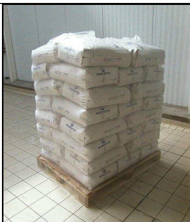
Pallet sizes : 100 x120 x Height : 145 to 150 cm